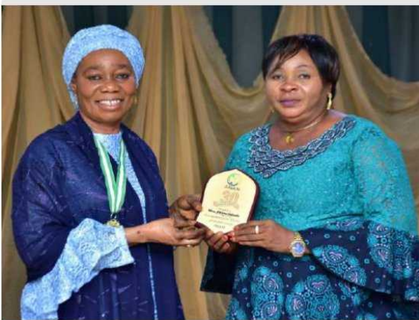
Photo Gallery Celebrating Milestones: A look back @Q4 2025 events