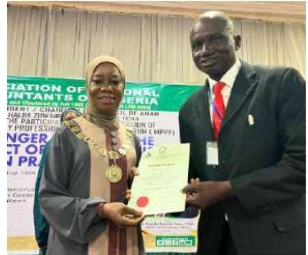
ANAN 2nd Session of 2025 MPPF programme and Induction Ceremony in Lagos in November, 2025