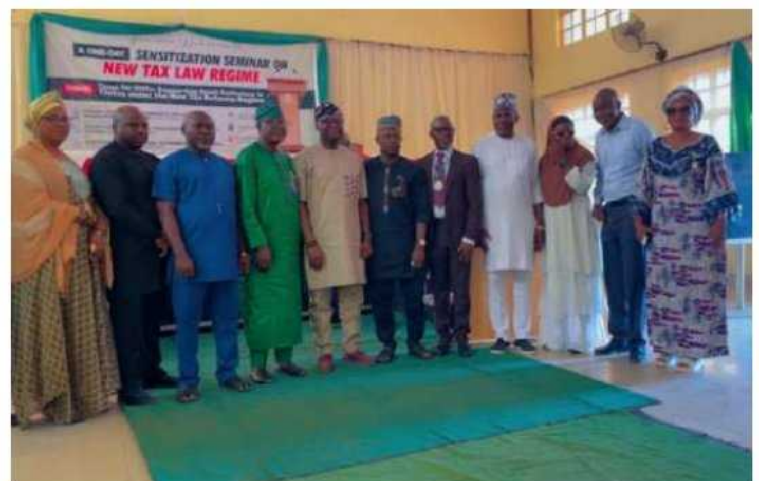
Officials of ANAN Kwara Branch, CITN Kwara Chapter, KWACCIMA, resource persons, and invited guests at the seminar in Ilorin, Kwara State

They advised SMEs to ensure high standards of transparency, tax literacy, meticulous bookkeeping, and accurate financial records for long-term business sustainability.