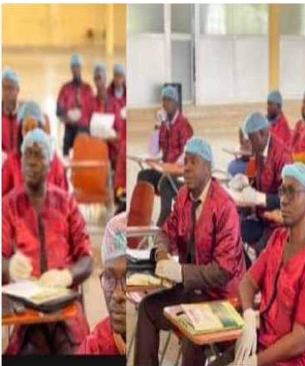
A cross section of participants at ANAN training partnership with CIFCFIN held at NCA, Kwall, Plateau State October, 2025