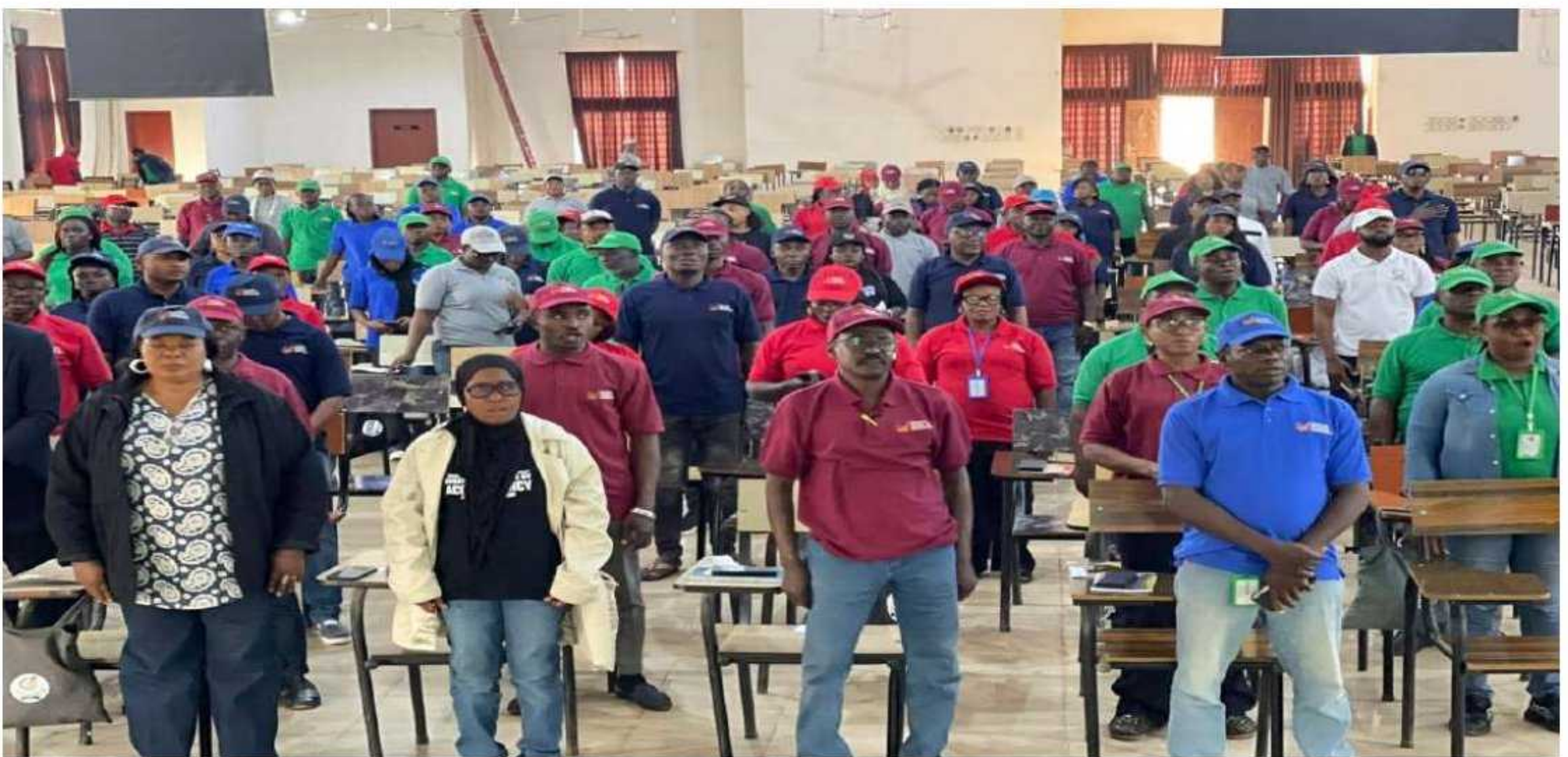
Cross-section of participants at the AIT/ICT Workshop in Kwall, Plateau State