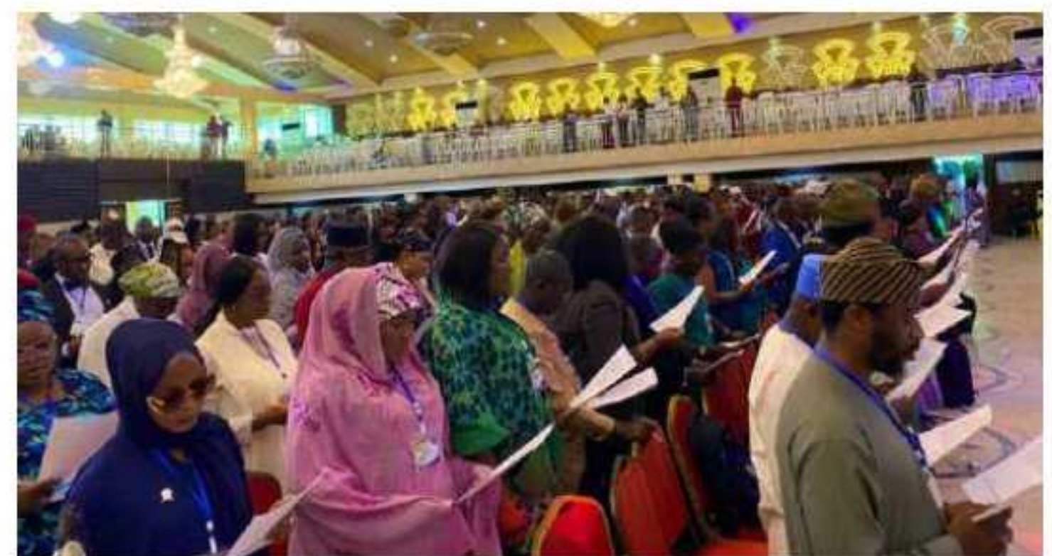
Cross section of inductees taking the Oath of Allegiance at the Induction Ceremony in Abuja

All nominations must be submitted through ANAN state branches to the office of the CEO, on or before 31st July, 2026.