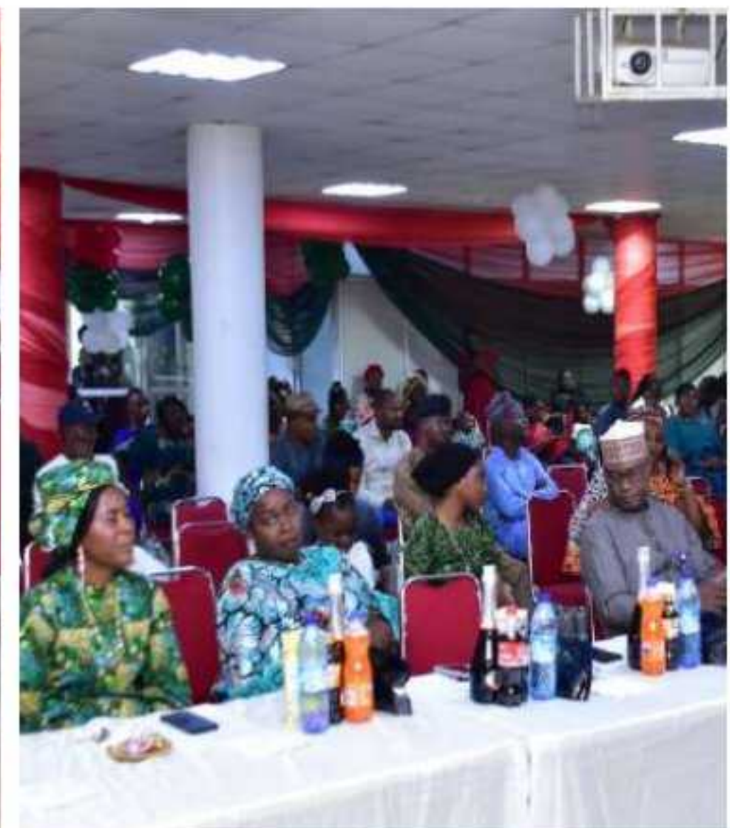
Cross Section of management and staff members at the End of Year Party and Long Service Awards celebration