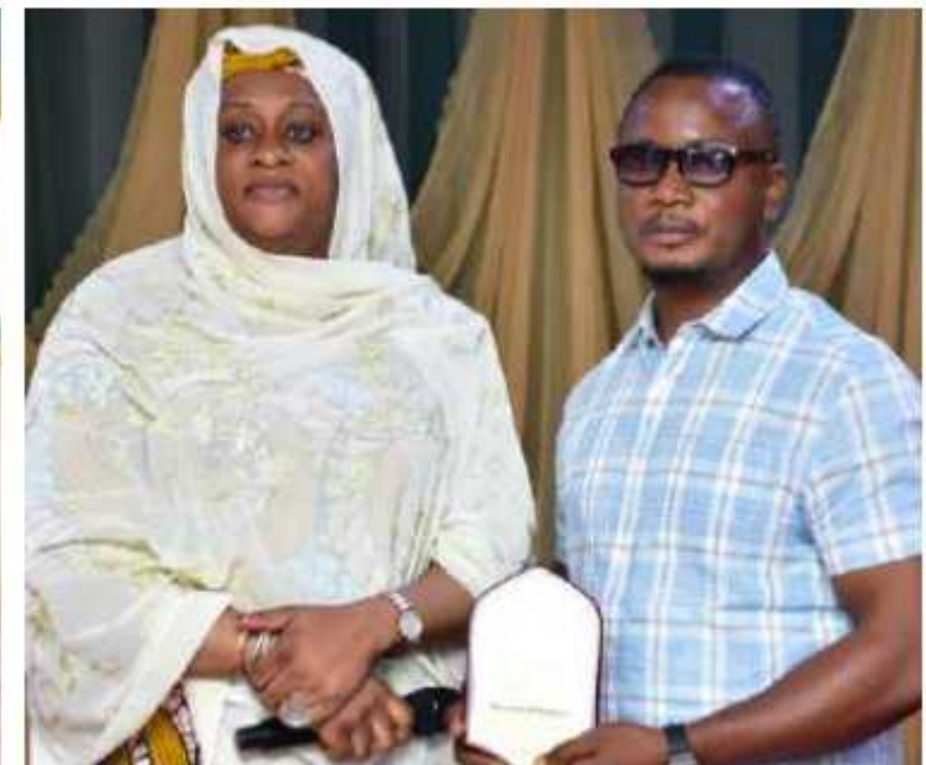
Presentation of Long Service Awards to ANAN Staff during 2025 End of Year Party Celebration at the National Headquarters, Abuja on Friday, 12th December, 2025