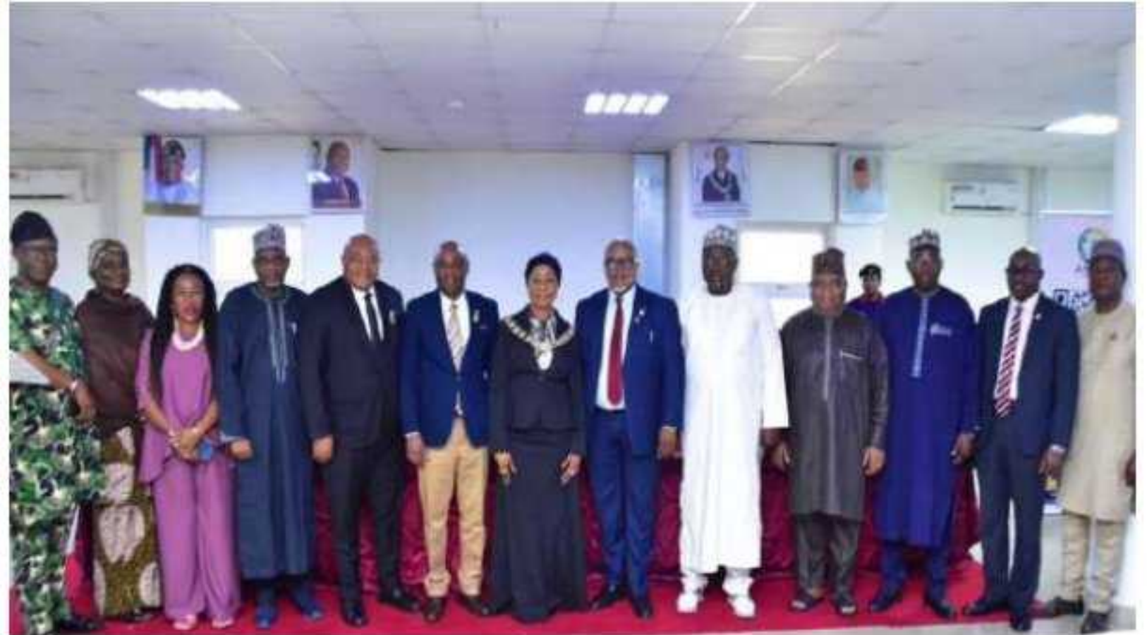
Induction Ceremony of New ANAN Members during the 3rd Session of 2025 Membership Retreat in Abuja in November, 2025