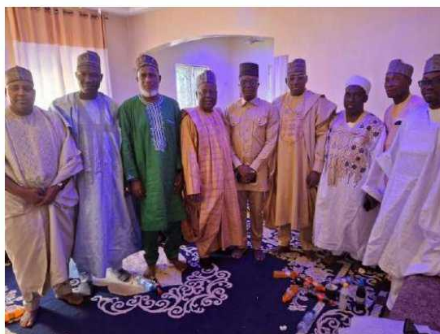
ANAN Council delegates, Acting CEO, Management Staff and guests at the wedding ceremony