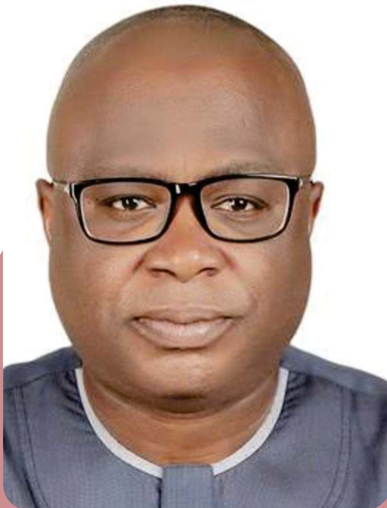
HON. MAXWELL IBIBAI COMMISSIONER OF FINANCE, BAYELSA STATE