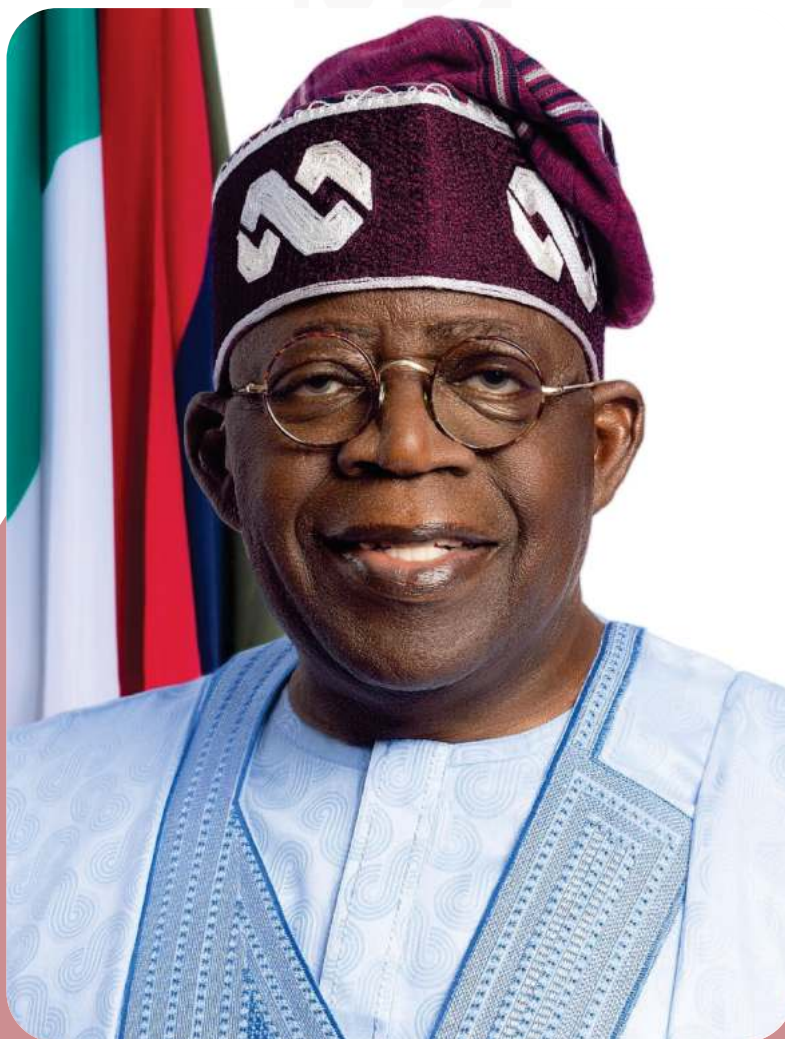
HIS EXCELLENCY BOLA AHMED TINUBU, GCFR PRESIDENT AND COMMANDER-IN-CHIEF FEDERAL REPUBLIC OF NIGERIA