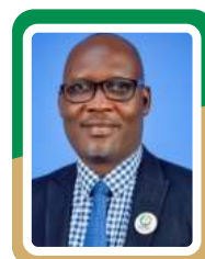
Hon. Lawal R. Olajide, CNA