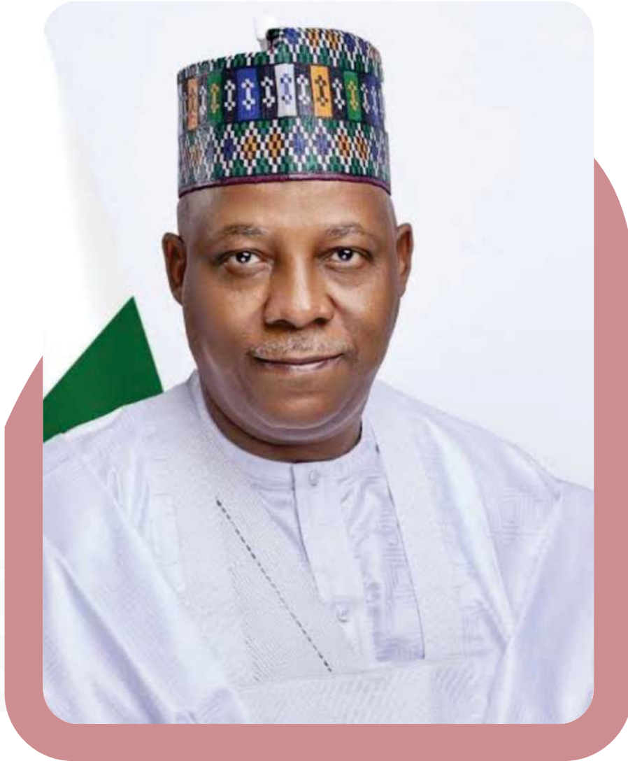
HIS EXCELLENCY SEN. KASHIM SHETTIMA, GCON VICE PRESIDENT FEDERAL REPUBLIC OF NIGERIA