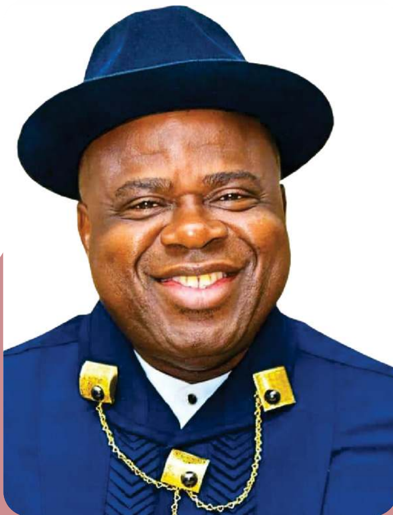
HIS EXCELLENCY SEN. DOUYE DIRI EXECUTIVE GOVERNOR, BAYELSA STATE