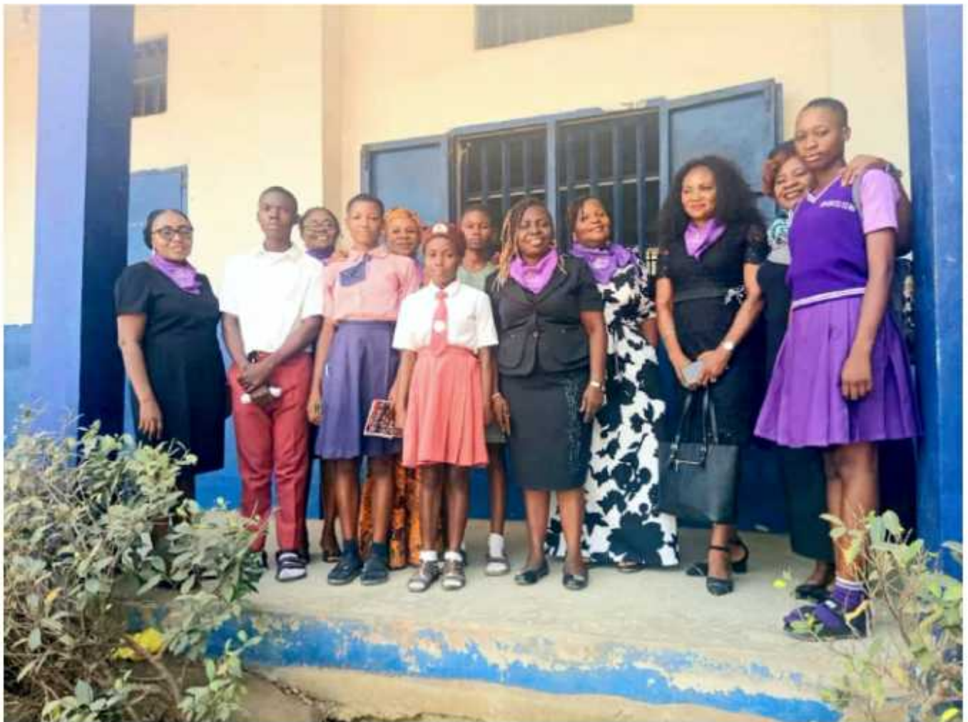
PROWAN Cross River State Chapter- Registration of SSCE for 5 brilliant less privileged girls in 5 secondary schools in Calabar on 28th January, 2022

The 5 lucky girls received the sum of N25,000 each.