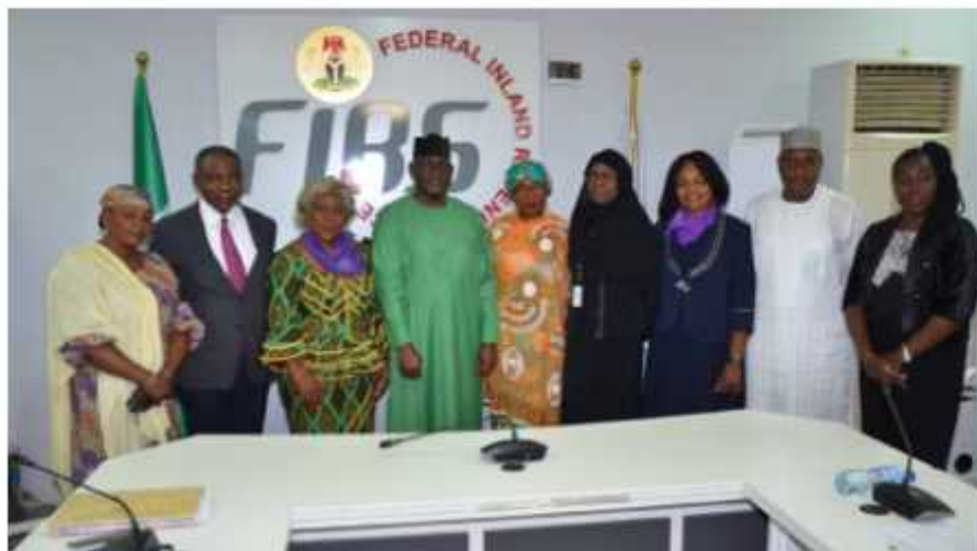
FIRS Mgt With Leadership of PROWAN

In his welcome address, the FIRS Chairman expressed his delight at the satisfactory conduct of PROWAN members in the employment of FIRS. He extolled the women who always demonstrated a high sense of professionalism and accountability in the discharge of their responsibilities.