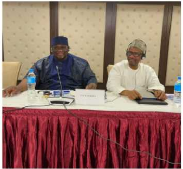
ANAN PRESIDENT AND CEO AT ABWA MEETING IN NIAMEY