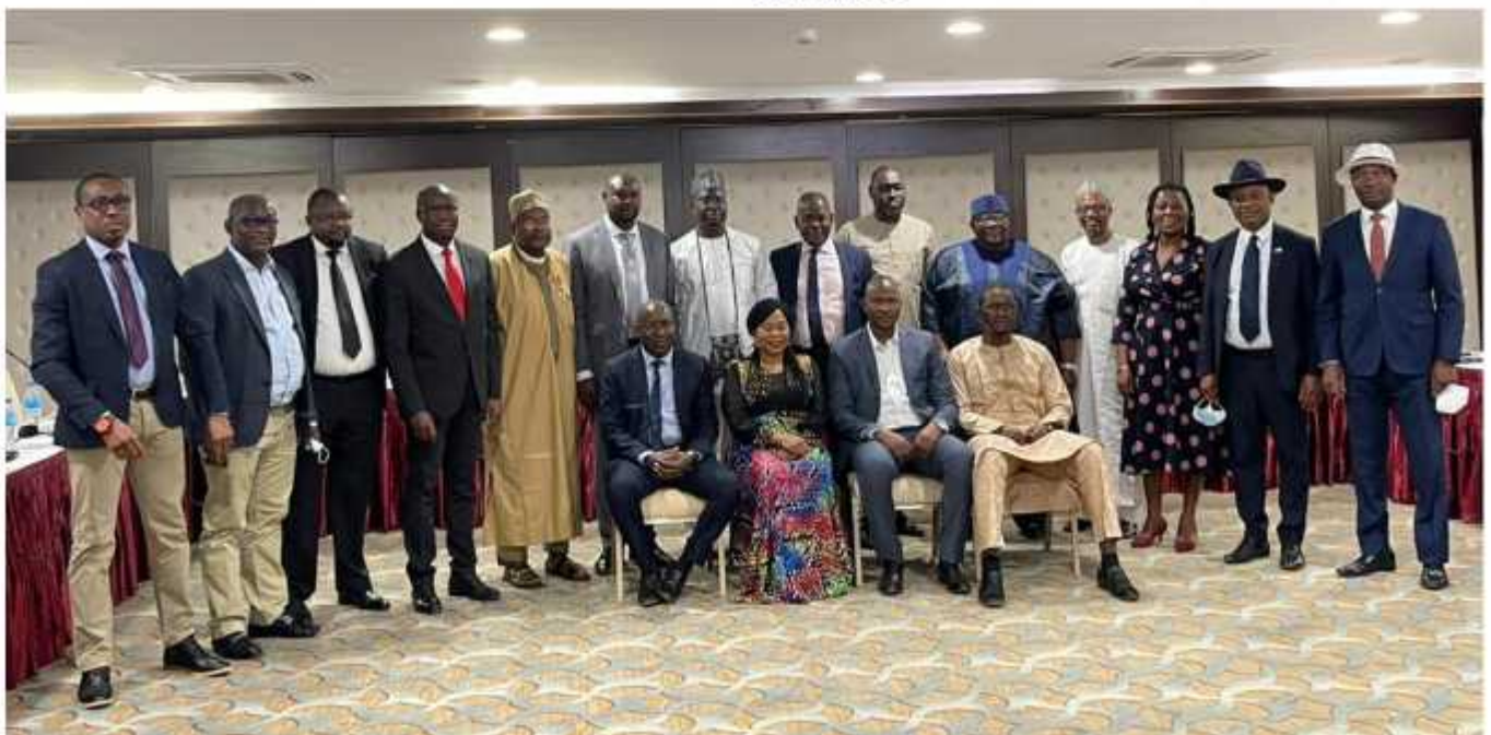
GROUP PHOTOGRAPH OF COUNCIL MEMBERS AT ABWA 91ST MEETING