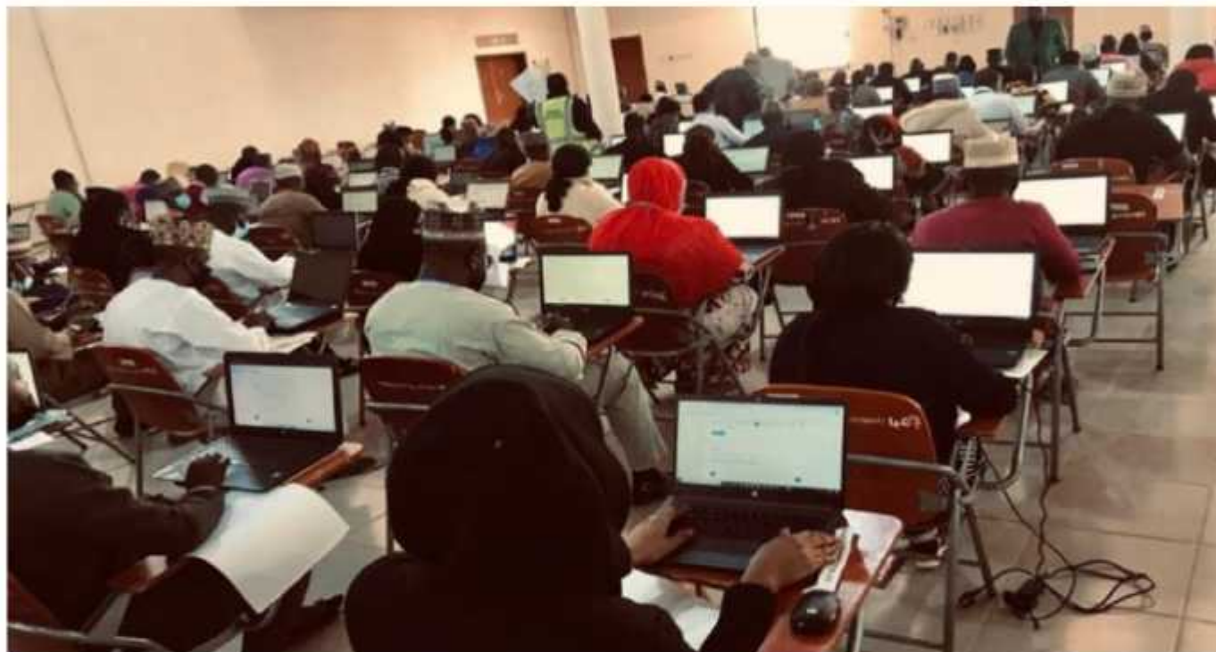
NCA EXAM HALL