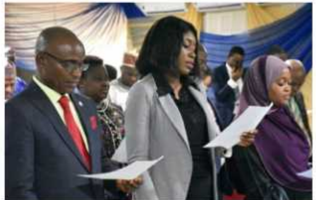
INDUCTEES SWEARING THE OATH