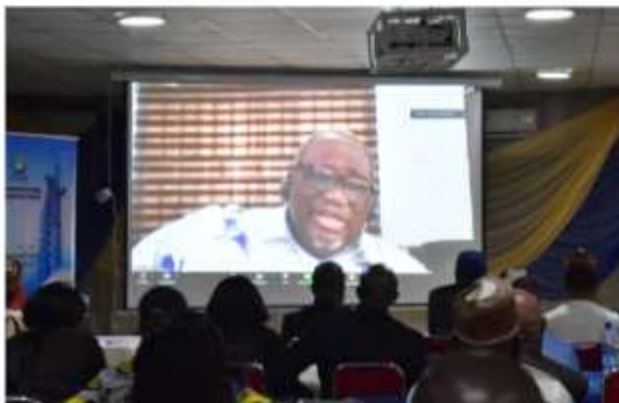
THE PRESIDENT'S VIRTUAL ADDRESS TO MEMBERS AT THE RETREAT