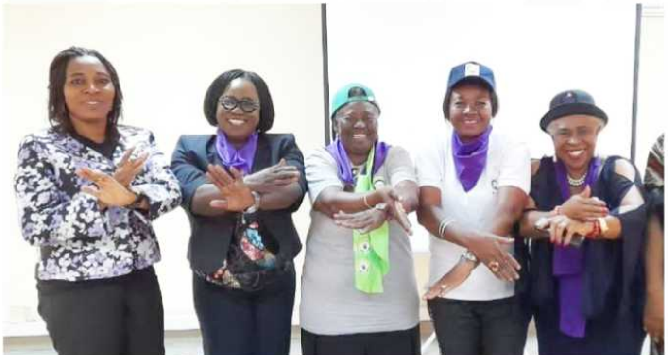
PROWAN MEMBERS AND GUESTS AT THE PROGRAM DISPLAYING THE SYMBOL OF 2022 IWD

The hybrid event which held at ANAN Regional office, Lagos was motivational and attendees were charged for better efficiency.