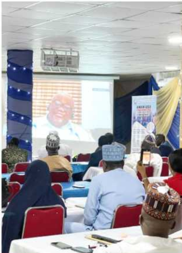
ATTENDEES LISTENING WITH RAPT ATTENTION

The induction ceremony sworn 87 seasoned professionals to the Association.