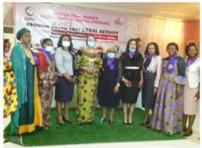
GROUP PHOTOGRAPH WITH THE DEPUTY GOVERNOR OF ENUGU STATE AND PROWAN LEADERS