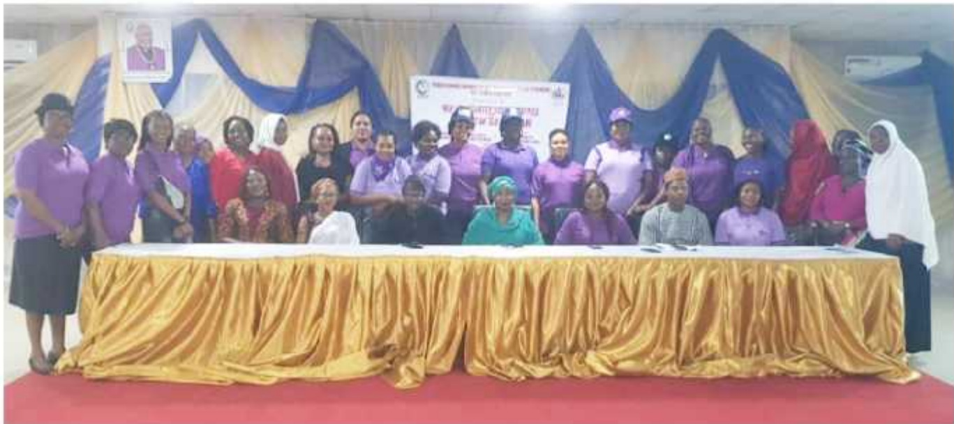
GROUP PHOTOGRAPH OF ATTENDEES AND ORGANIZERS OF THE PROGRAM AT ANAN HOUSE, ABUJA