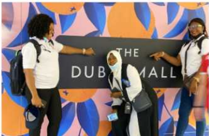
SOME ATTENDEES ENJOYING THE BEAUTIFUL SITES AND SCENERY OF DUBAI AT THE BREAK OUT SESSION DURING THE CONFERENCE.