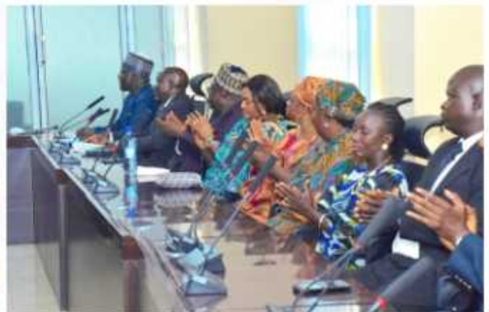
CROSS SECTION OF BRANCH EXECUTIVES