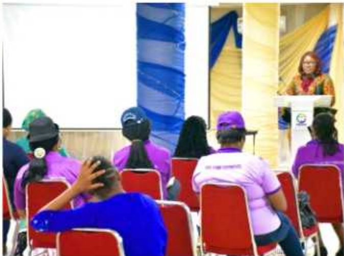
SENSITIZATION ON EARLY DETECTION TO CURB BREAST AND CERVICAL CANCER