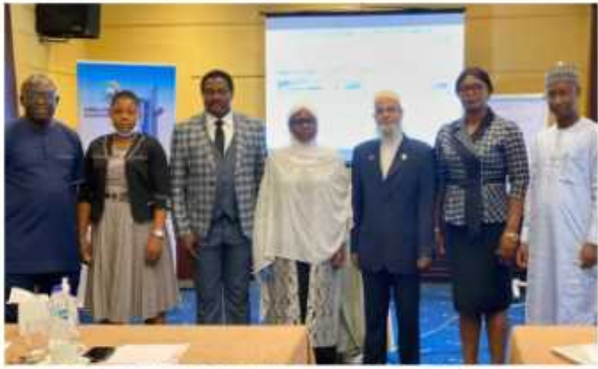
SOME ATTENDEES WITH THE FACILITATORS AFTER THE PRACTICAL TRAINING CONFERENCE