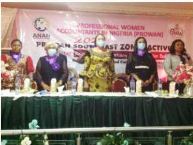
L-R VICE CHAIRMAN OF ENUGU BRANCH, CHAIRPERSON OF PROWAN, DEPUTY GOVERNOR OF ENUGU STATE, PROWAN COORDINATOR, ENUGU AND ENUGU STATE AUDITOR GENERAL FOR LG