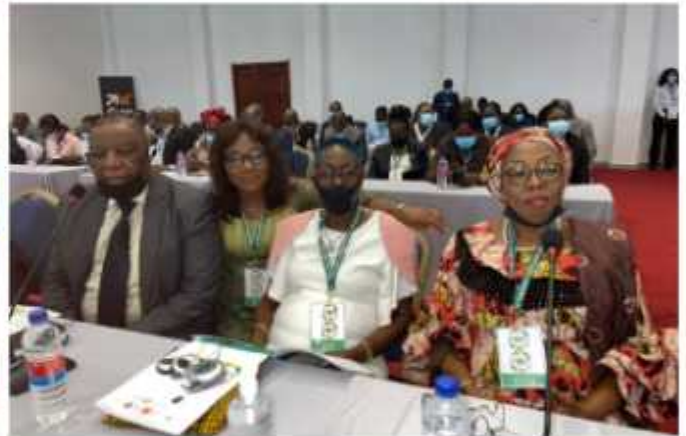
PAST PRESIDENTS AT THE CONGRESS IN MONROVIA