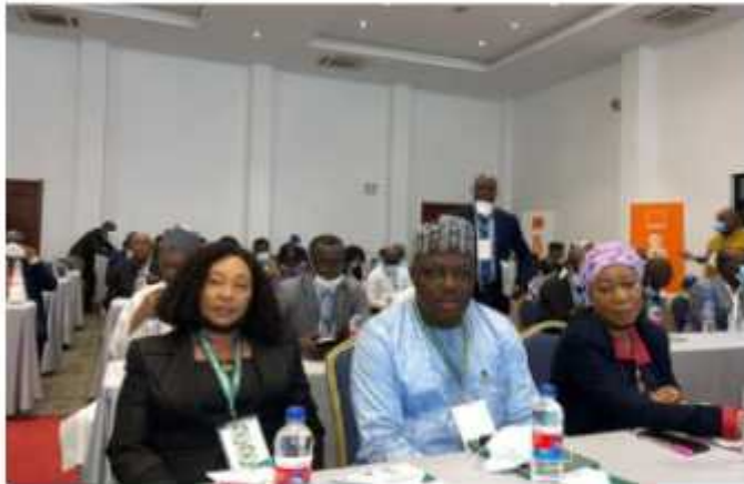
COUNCIL MEMBERS AT THE EVENT IN MONROVIA