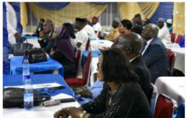
MEMBERS AT THE RETREAT