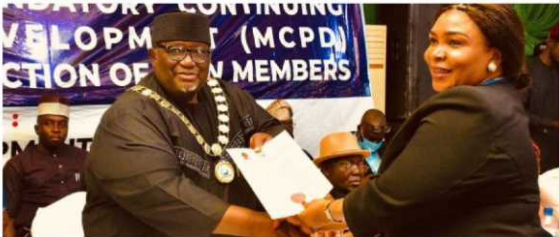
PRESENTATION OF CERTIFICATE TO AN INDUCTEE

The new inductees swore their oath of allegiance at the induction ceremony with enthusiasm and excitement.