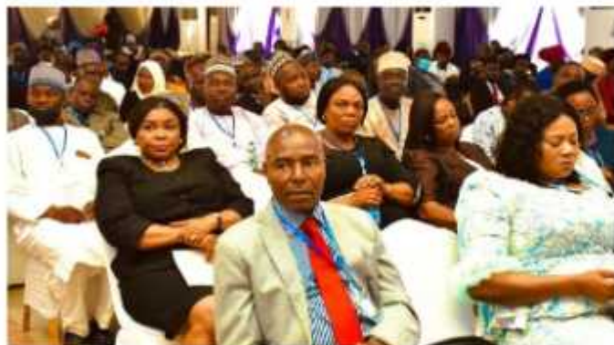
CROSS SECTION OF ATTENDEES AT THE 1ST SESSION OF 2022 MCPD HELD IN ABUJA

Issues advocated at the training are Accountants upskilling in knowledge of financial regulations, deployment of IPSAS adoption for comparability of financial statements and enhanced financial disclosures for better decision-making.