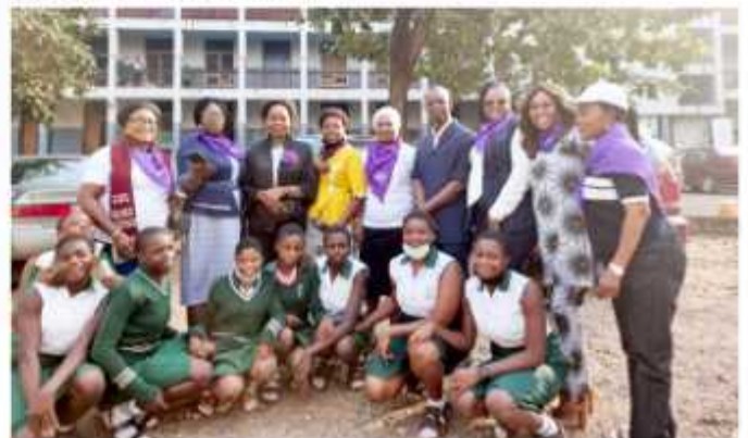
PROWAN OYO STATE CHAPTER - CAREER TALK AT ST. LOUIS GRAMMAR SCHOOL MOKOLA, IBADAN ON THE 1ST FEBRUARY, 2022