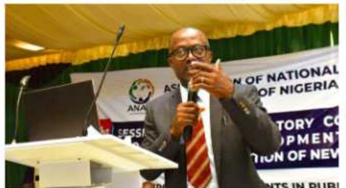
PROF PVC OKOYE DELIVERING THE TOPIC ACCOUNTING IN THE PUBLIC SECTOR