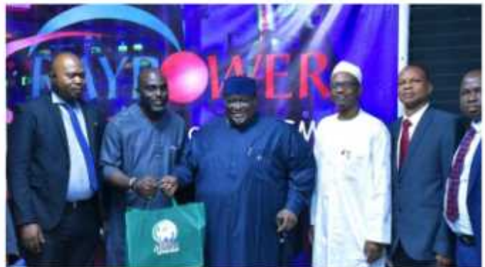
STATION MGR AT RAYPOWER FM (2ND LEFT) RECEIVING A GIFT FROM ANAN PRESIDENT, FLANKED BY ANAN CEO (3RD RIGHT), DIRECTOR ADMIN, AND CHAIRMEN OF FCT, ABUJA 1&2 DURING MEDIA ROUNDS.