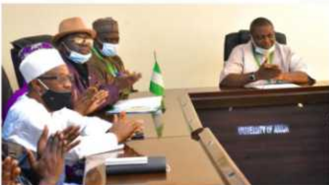
EXCO MEMBERS DURING THE VISIT

He further noted that the Association is focused on continual development of Accounting professionals through knowledge and skills in line with latest financial and technological realities.