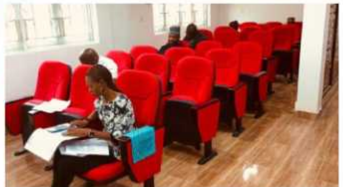
ANAN UNIVERSITY, K WALL COMMENCES FIRST SEMESTER EXAMS WITH PIONEER SET OF MSc AND PHD STUDENTS IN K WALL AND ABUJA CENTRES.