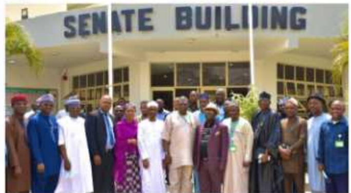
GROUP PHOTOGRAPH WITH MGT STAFF OF UNIVERSITY OF ABUJA, GWAGWALADA AND ANAN DIGNITARIES