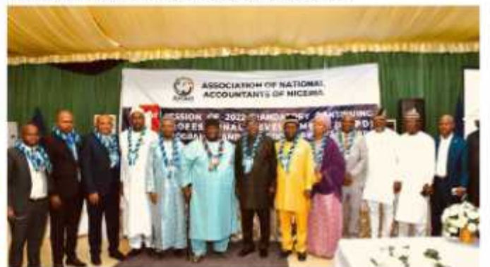
ANAN PRESIDENT(6TH LEFT) AND CEO (5TH LEFT) WITH EXCO MEMBERS AND OTHER DIGNITARIES