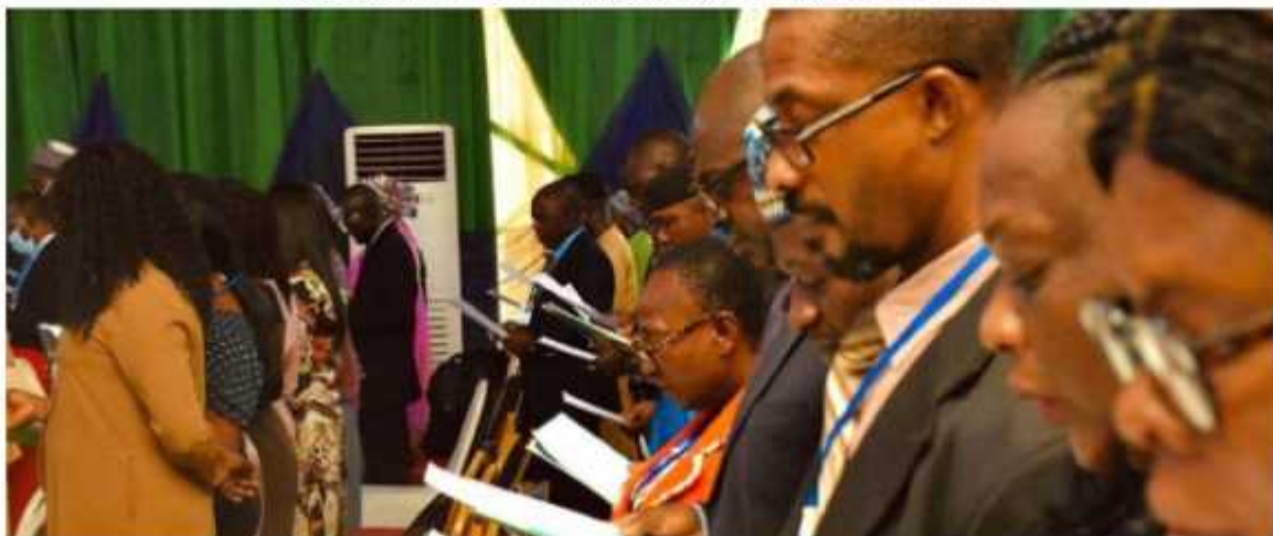
TAKING THE MEMBERSHIP OATH